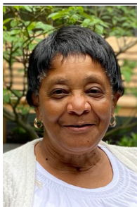
Lafredia Bolding Infant Toddler Center Support